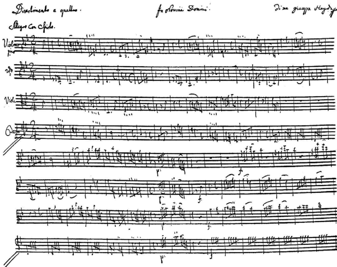
[ First page of Haydn's manuscript of the Quartet in G Minor, Opus 20, Number 3 ]

THE YEAR 1772, in which Haydn's six string quartets Opus 20 were written, belongs to one of the most significant periods in the history of art. A movement which had been promoted for many years by a small group of North-German composers was now swaying the minds of the greatest artists far beyond the territory of its origin. Carl Philipp Emanuel Bach, Johann Sebastian's second son, while serving as court cembalist to King Frederick the Great of Prussia, had formulated a musical idiom of highly individual expression, imbuing instrumental music with the emotional fervor and passion hitherto only found in vocal composition. When Haydn was still an unknown and struggling young musician, he had pored over the clavier works of the "Berlin Bach" with the greatest fascination, but it took him a long time until he was ready to draw the ultimate consequences from these studies. Turning his back on the light charm and merry grace of his earlier works, he began in the seventeen seventies systematically to explore the possibilities